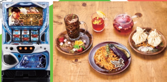
Pachislo machines Amusement facilities (Café collaboration)