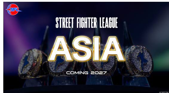
Asia League coming in 2027

Inquiries regarding the above information may be directed to: