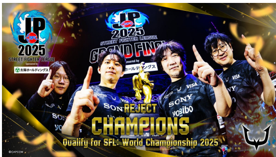
Street Fighter League: Pro-JP 2025 Grand Final Championship Team: REJECT