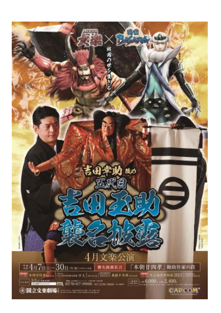
Ningyo Joruri Bunraku \times Sengoku BASARA collaboration poster