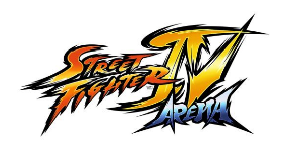
"Street Fighter IV Arena"