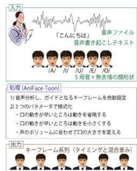
Figure 1 About "AniFace"

recorded voice data, or voice data and dialog 2. Complete mouth animation