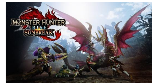
Monster Hunter Rise: Sunbreak