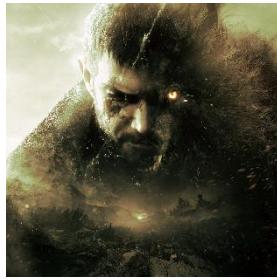
Resident Evil Village Gold Edition scheduled for October 28 release