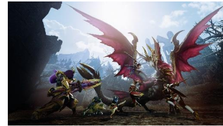
Monster Hunter Rise: Sunbreak tops cumulative 3 million units in sales (as of July 13)