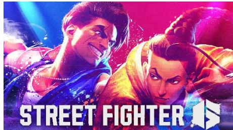
Street Fighter 6 , the latest title in the series, scheduled for 2023 release