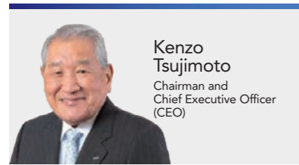
Kenzo Tsujimoto Chairman and Chief Executive Officer (CEO)

Jun. 1983 President and Representative Director of the Company Apr. 1997 Chairman of the Association of Copyright for Computer Software Apr. 2001 Chief Executive Officer (CEO) of the Company (to present) Jul. 2007 Chairman and Representative Director of the Company (to present) Dec. 2007 CEO of Kenzo Estate, Inc. (to present) Feb. 2010 Representative Director of Kenzo Estate Winery Japan Co., Ltd. (to present)