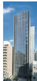
R&D Building #2