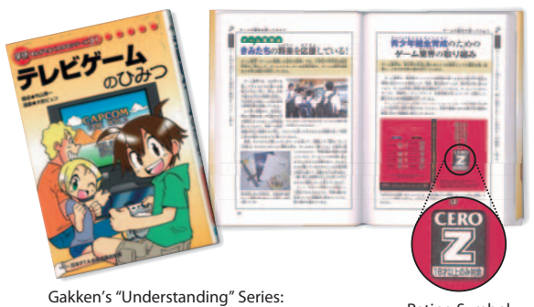
"Secrets of Video Games"

* From the results of the 4th CERO Age-Based Ratings System Field Survey