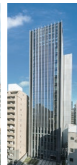
R&D Building #2