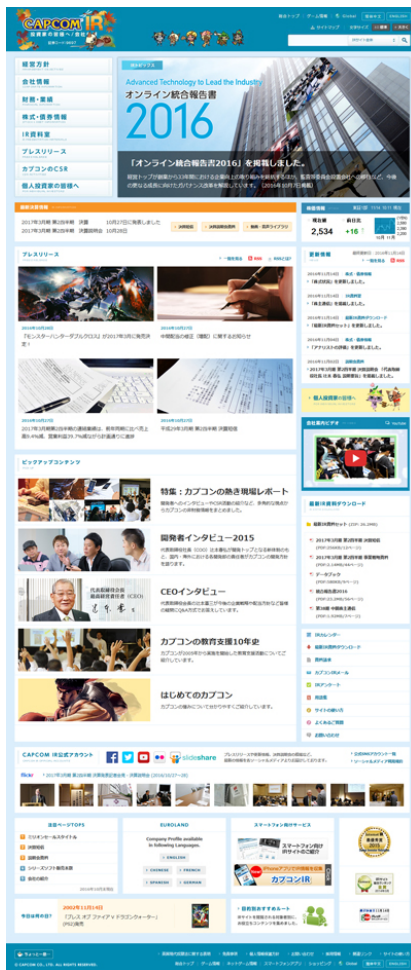
IR Site Top Page