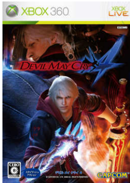
Devil May Cry 4