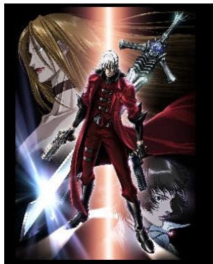
Devil May Cry Anime