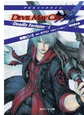
Devil May Cry 4 Novel

©2007 CAPCOM CO., LTD. / DMC Production Committee