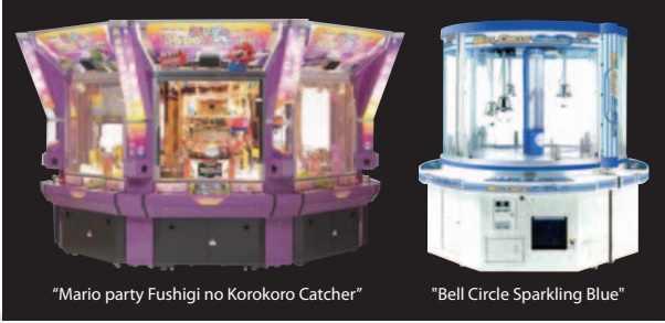
Licensed by Nintendo ©2007 Nintendo / ©2007 HUDSON SOFT / ©CAPCOM CO.,LTD.2009 ALL RIGHTS RESERVED

We develop, produce and distribute arcade games for amusement facilities. We concentrate our efforts on the development of coin-operated and prize-winning games, which are in high demand, and supply software for arcade video games to secure a stable customer base.