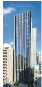
R&D Building #2