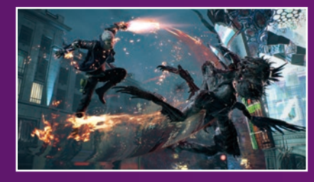
Master demon hunter Nero returns

I think announcing both of these titles at E3 conveyed the momentum we have going at Capcom.