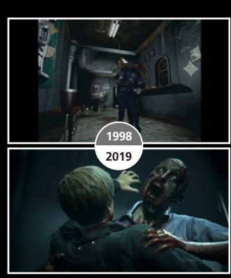
Zombies attack the protagonist, Leon