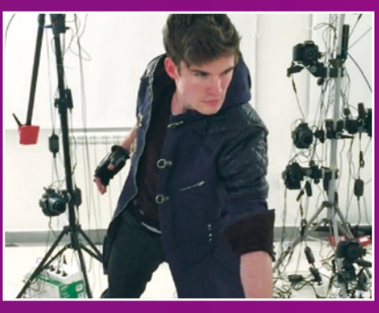
Scanning a British model in pursuit of photorealism