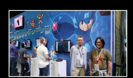
Announcing the demo version at E3

In preparing promotions ahead of the launch, we are pulling out all the stops, including a 30th anniversary concert in Japan and an animated TV show in North America. We are making a truly enjoyable game that goes beyond countries and cultures, and with this title as a new starting point, we aim to capture the hearts of game fans around the world.