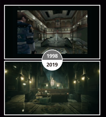
The zombie-ridden police station

The new Resident Evil 2 revives the appeal of this title by recreating it from the ground up using Capcom's cutting-edge development technologies. The classic zombie horror that plunged users into the depths of terror has been reimagined using Capcom's RE ENGINE to depict a photorealistic Raccoon City, where the tragedy unfolds.