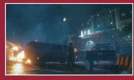
Raccoon City, the game's terrifying setting

Actually, around that time, many of us were working on Resident Evil 7 biohazard (hereinafter "7"). Survival horror game fans have more than one need. 7 attempted to provide the ultimate horror experience with an overwhelming sense of immersion using VR. RE 2 aims for horror and entertainment, a game that is both scary and exciting. Each pursues a different way to enjoy the game. I think the diversity of this series, while always centered on horror, is very appealing.