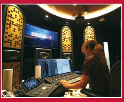
Newly built dynamic mixing stage