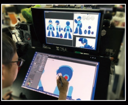
New Mega Man reborn through "master handicraft"