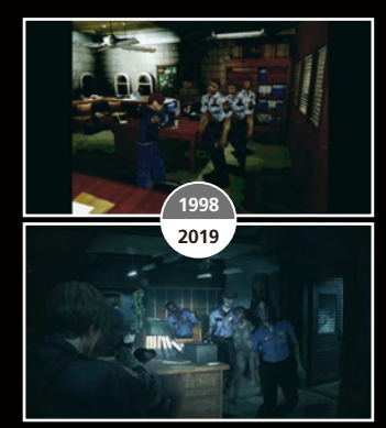
A herd of zombies approaches