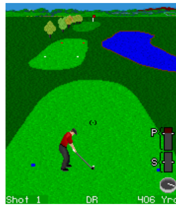
"Golf Channel: Mobile Tour"