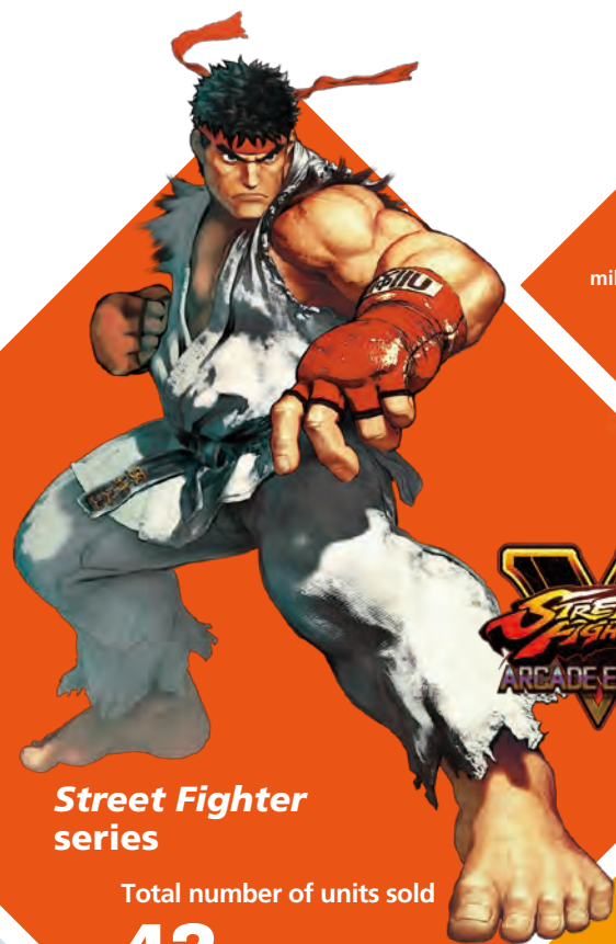
Street Fighter series

In the 36 years since our founding, our eagerness to take on new endeavors has given birth to countless popular brands. These brands have garnered massive followings both domestically and overseas.